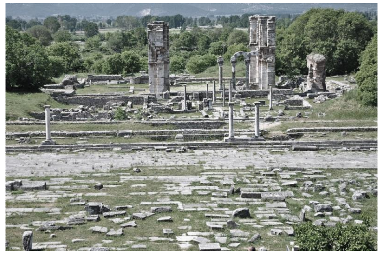
Forum looking south from Via Egnatia