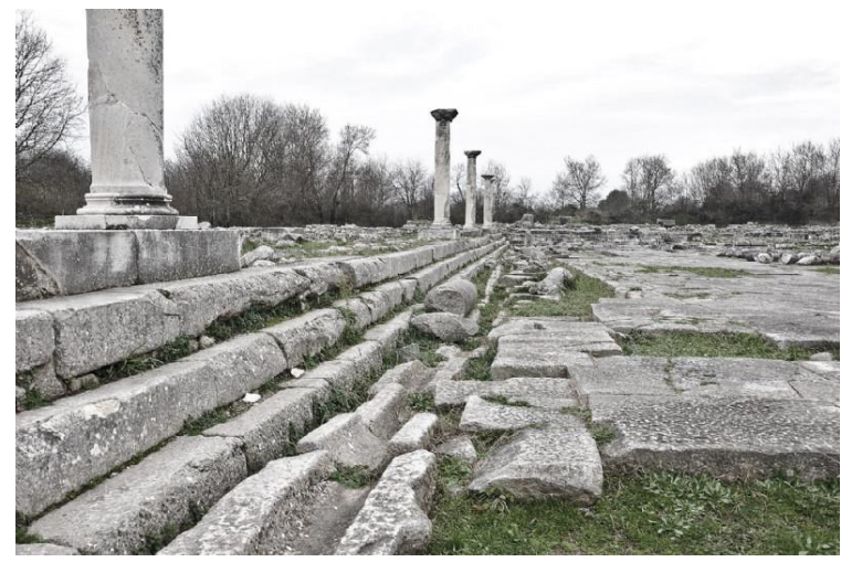
Forum looking west while standing on the east side