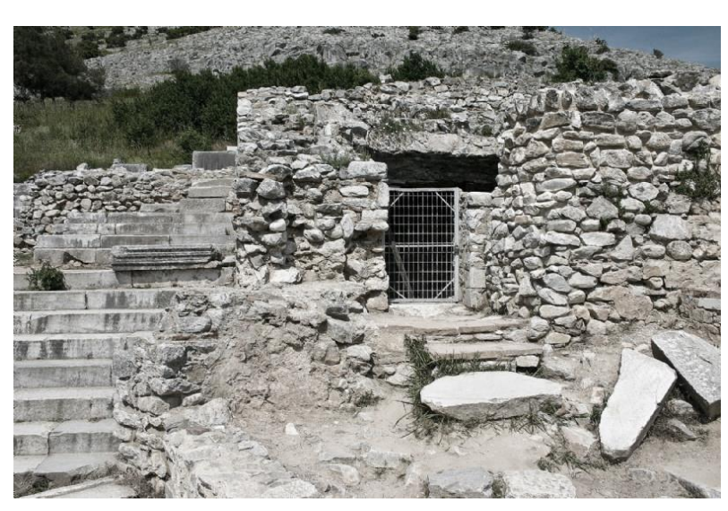
Prison Entrance on north side of Via Egnatia NW of the Forum (above)