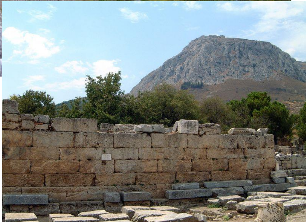
Bema with Acrocorinth in back