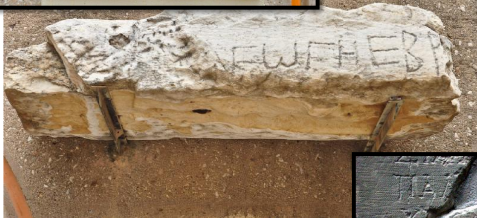
Synagogue Inscription - “The Synagogue of the Hebrews”

Gallio Inscription – found in Delphi mentioning Gallio (fourth line ΨΑΛΛΙΩ is GALLIO or γαλλιο). The inscription dates between April and July of 52 AD inferring that Gallio was proconsul of Achaia in 51 AD. Paul was in Corinth for 18 months from the fall of 50 AD until the spring of 52 AD.