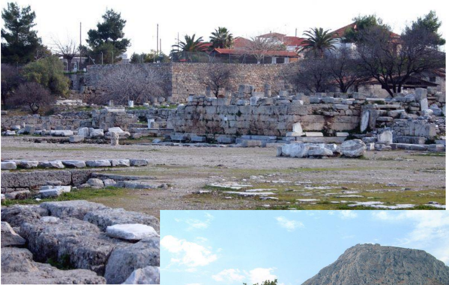
Bema in the Agora