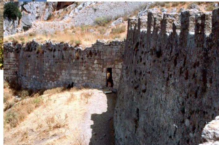
Wall of the Acrocorinth