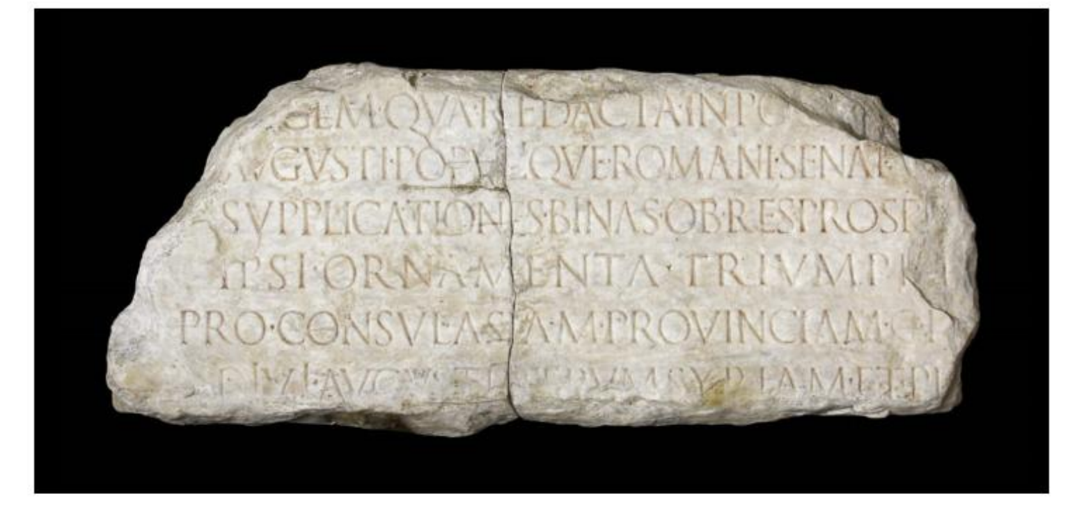
This inscription is from a tombstone discovered near Trivoli, Italy. It's owner was once "Twice Legate" of Augustus in Syria. Photo