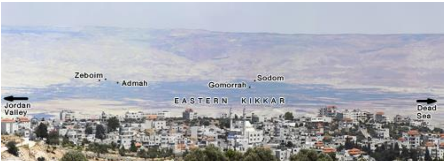
View of the Kikkar from Bethel-Ai, looking east.