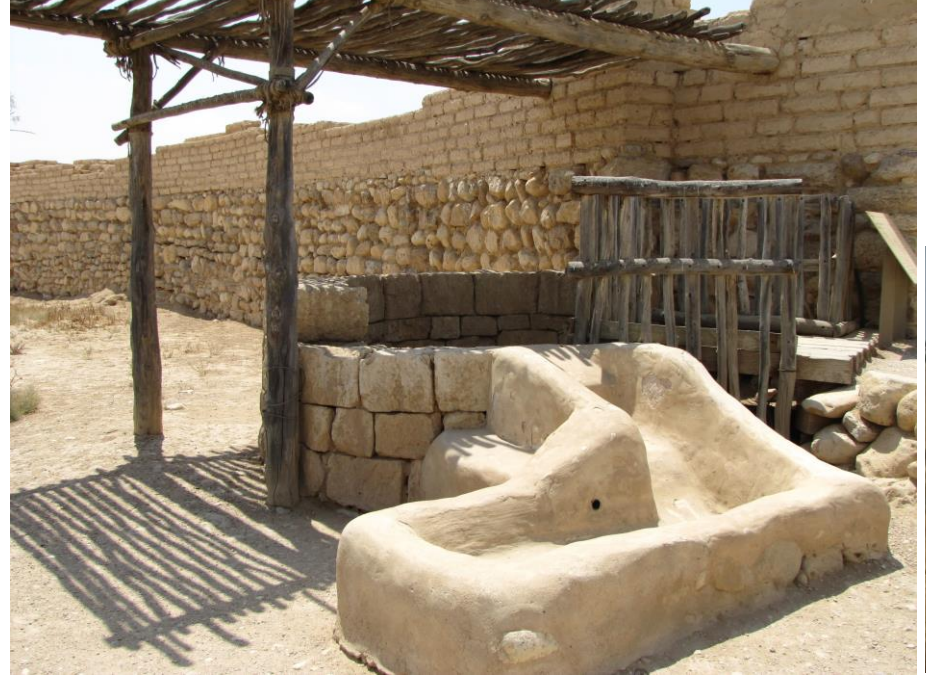
Well at the gate of ancient Beersheba