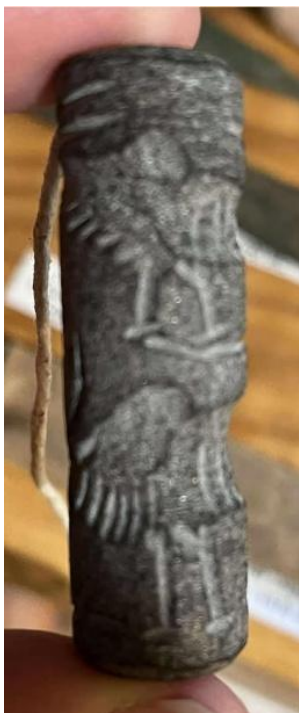
Mesopotamian Steatite Cylinder Seal 2000-1000 BC