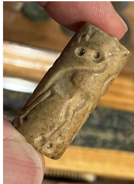
Mesopotamian Limestone Cylinder Seal 2000-1000 BC