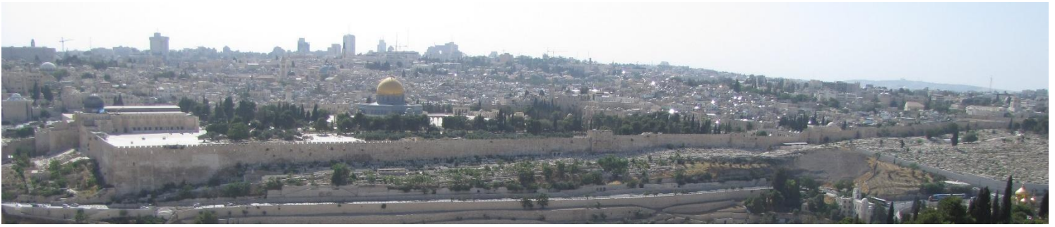
Church of the Holy Sepulcher