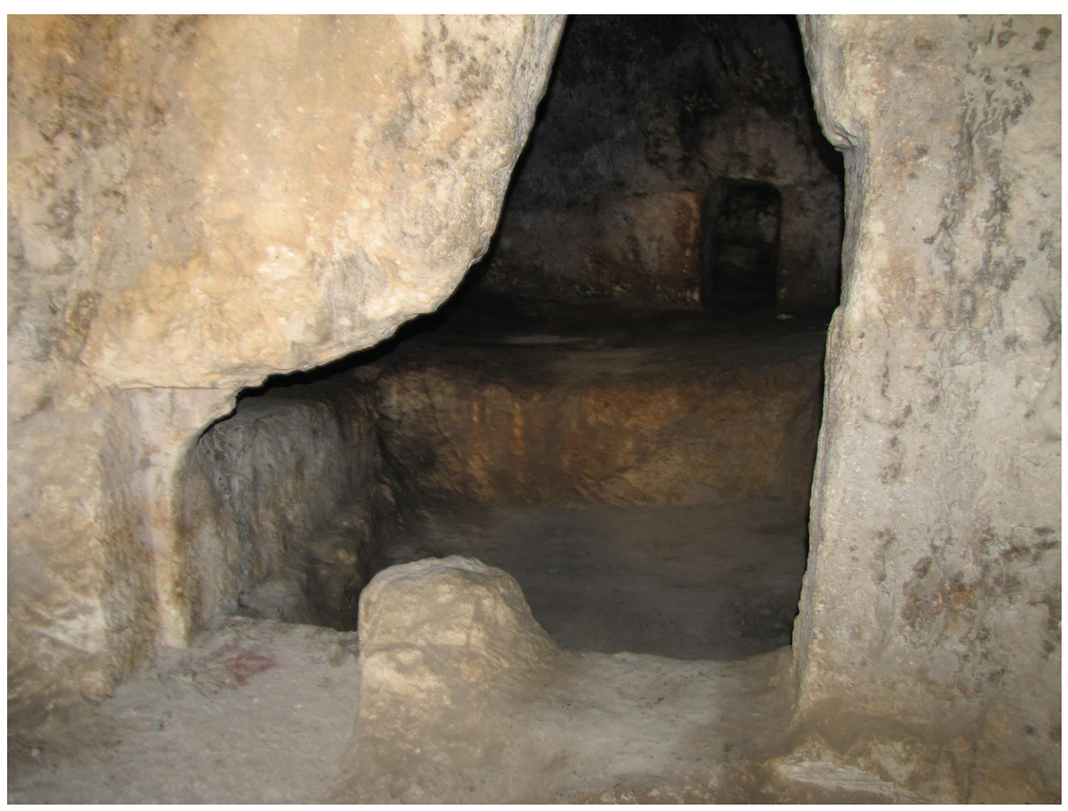
Burial bench called arcosolila and burial vaults called kokhim