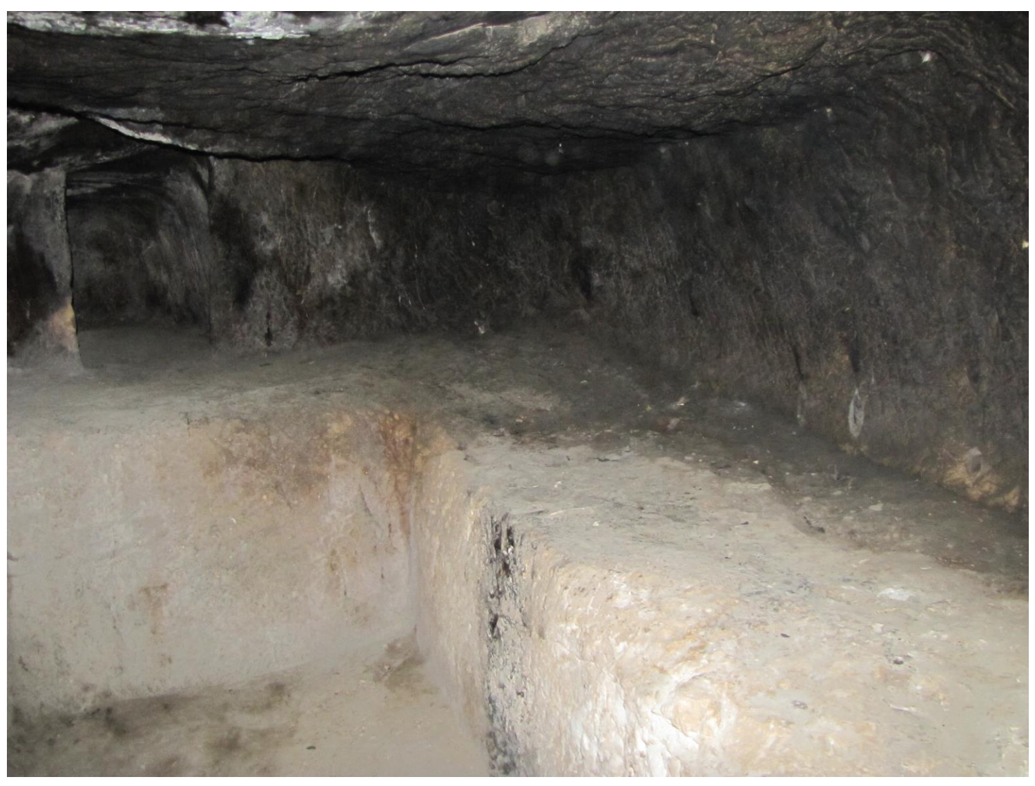
Burial bench called arcosolila and burial vaults called kokhim in side tomb on the side of the Mount of Olives