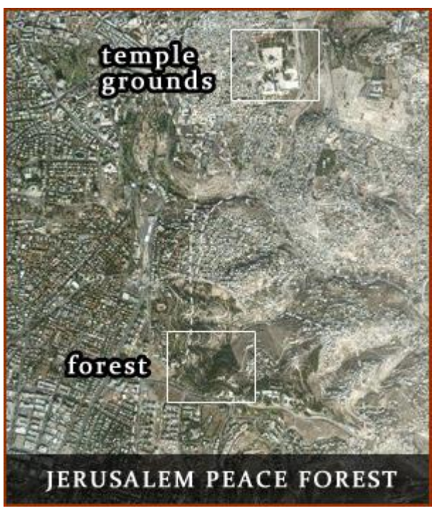
Location of the forest where Caiaphas' family tomb was found