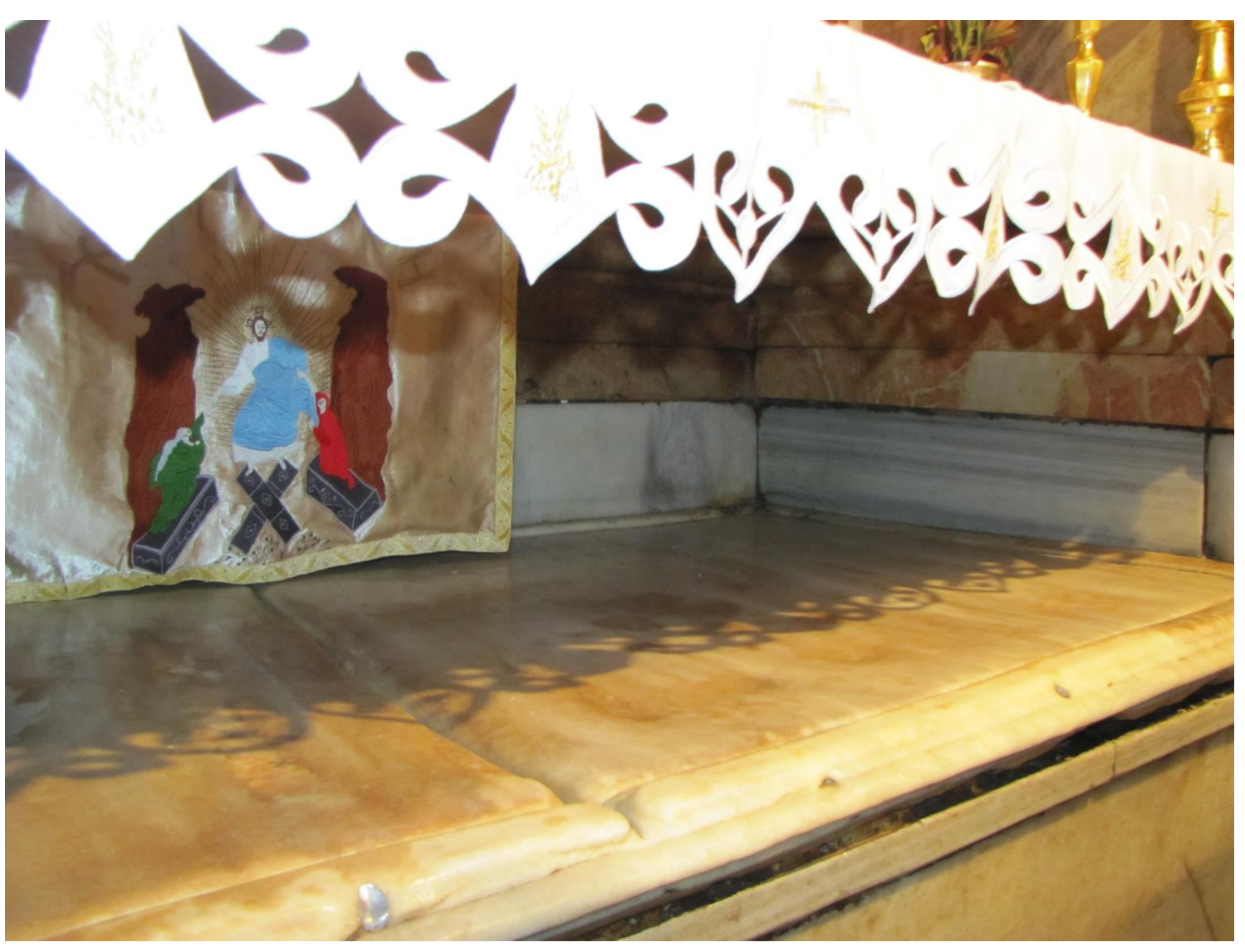
Photo of the burial bench inside the tomb of Jesus in the Church of the Holy Sepulcher