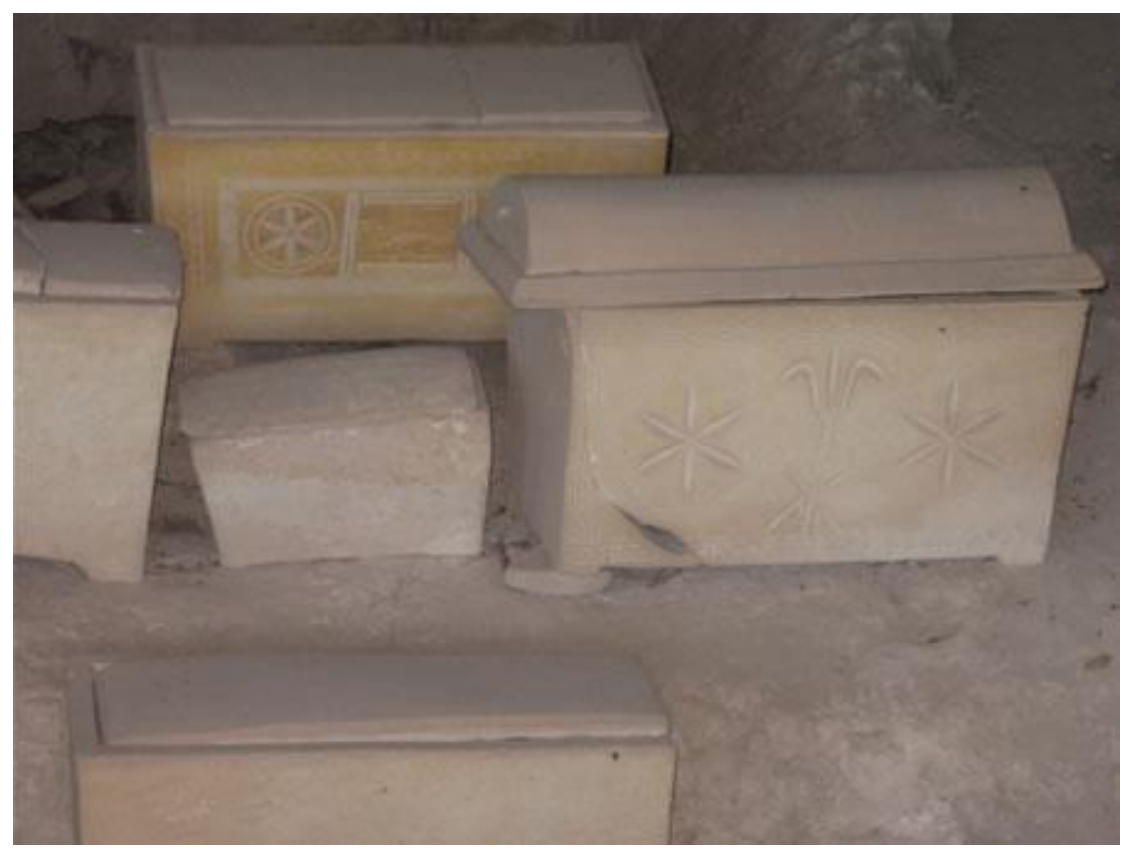
Ossuary Boxes on the Mount of Olives