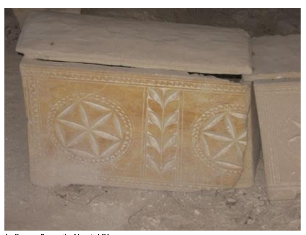
An Ossuary Box on the Mount of Olives