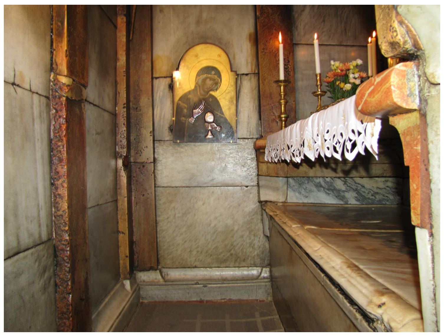
Photo of the burial bench inside the tomb of Jesus in the Church of the Holy Sepulcher