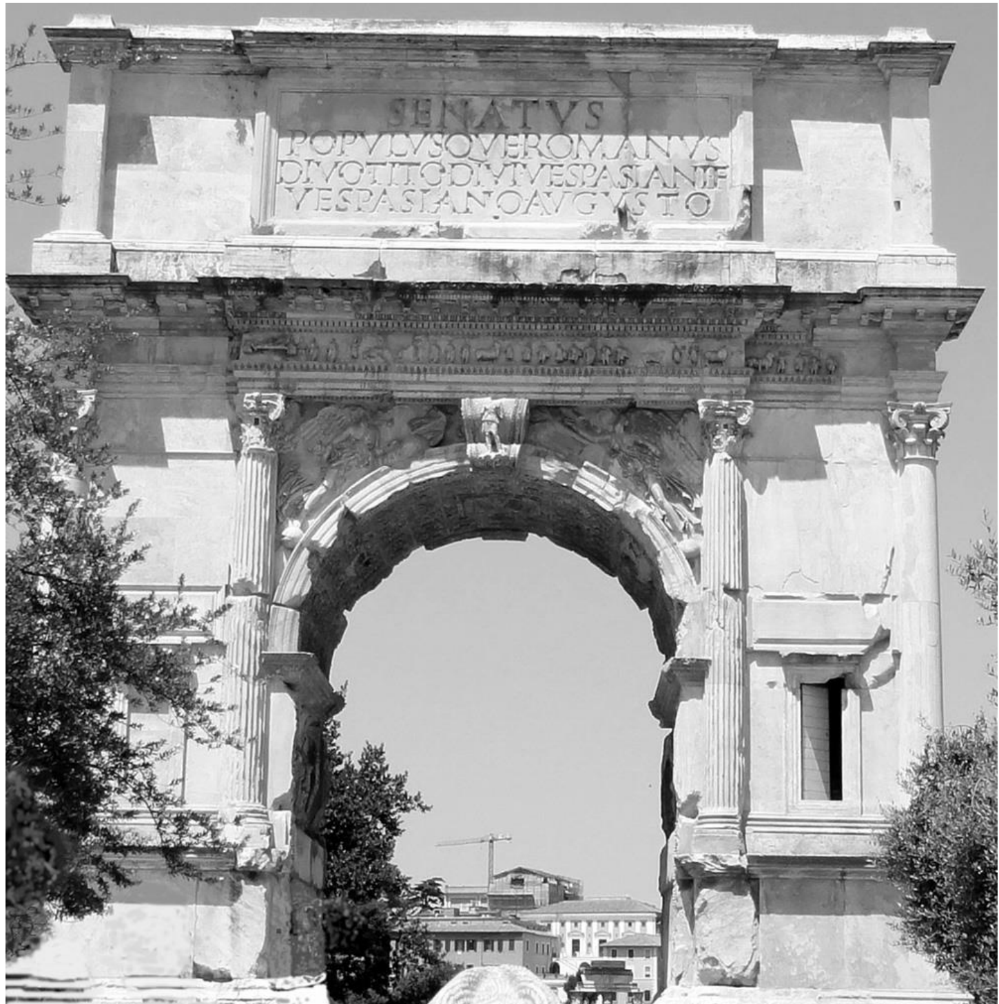
The Arch of Titus, located in Rome southeast of the Roman Forum, commemorates Titus' victory over the Jews and the end of the 66-70 AD Jewish revolt. This triumphal arch was built in 82 AD. The modern importance of this arch is in the engraving found on the inside which shows the Temple treasures being carried into Rome by Roman soldiers after their destruction of the Temple and the city of Jerusalem in 70 AD. The image clearly shows the golden Table of Showbread, the golden Candle Stand, and the trumpets used by the priests. Many other items from the Temple can also be assumed to have made it to Rome. It seems these Temple treasures were taken from Rome by the Vandals but recaptured by the Romans of the Byzantine Empire and taken to Constantinople. The Temple treasures portrayed on the Arch of Titus may have ended up stored in the Nea Church by Justinian.