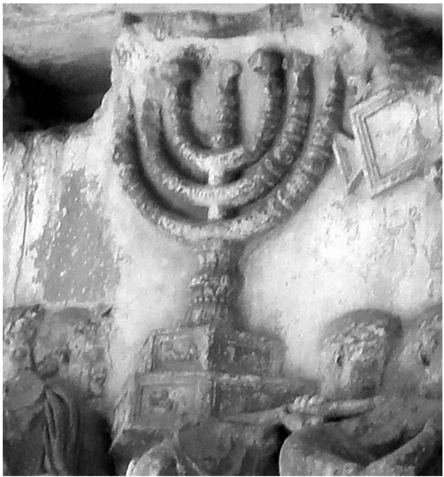
The Golden Lamp Stand from Herod's Temple of 70 AD.