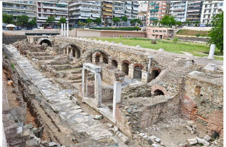
Forum or Agora of Thessalonica