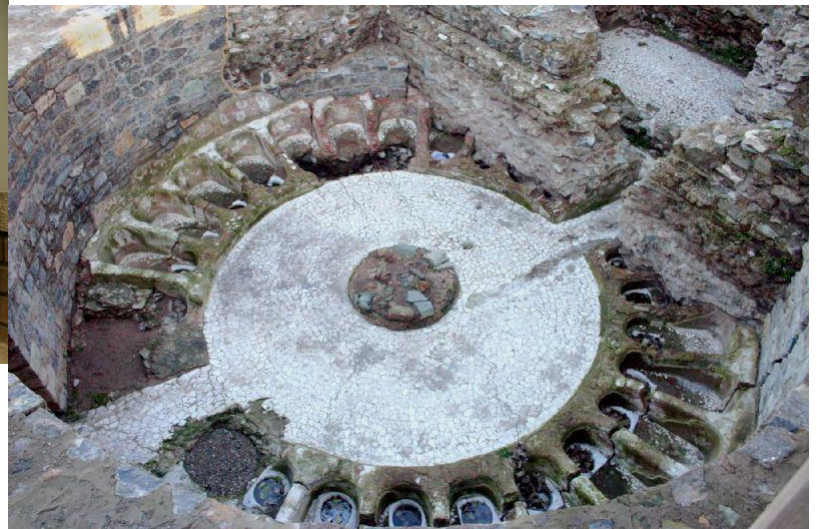
24 bathtubs at the southeast end of the Forum. Each tub has an upper and lower level.

An inscription from 125 AD found in Thessalonica lists six "Politarchs" (or, "Rulers of the Citizens"). This term "politarch" is used by Luke in Acts 17:6 and 8 to refer to officials in Thessalonica. Before the discovery of this inscription critics claimed the writer of Acts was making up information and had many false claims and incorrect statements. This along with other discoveries has validated the authenticity of the Book of Acts, and at the same time, has refuted the critics as ignorant and anti-scripture.