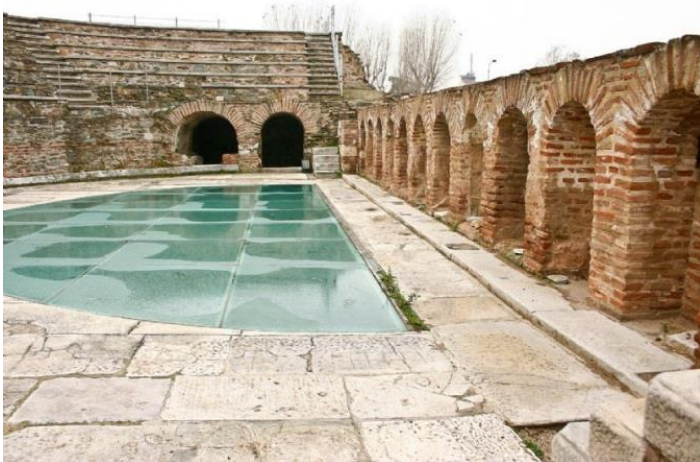
Odeum or Theater located east of the forum.