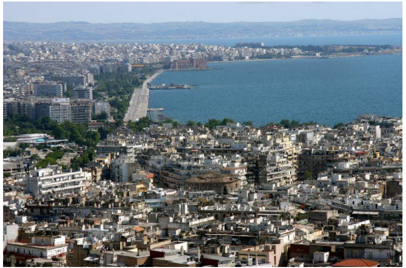
Modern Bay of Thessaloniki

17:10 – Leave the Via Egnatia (which continued west) Paul is taken 47 miles southwest to Berea which was on the road to Athens.